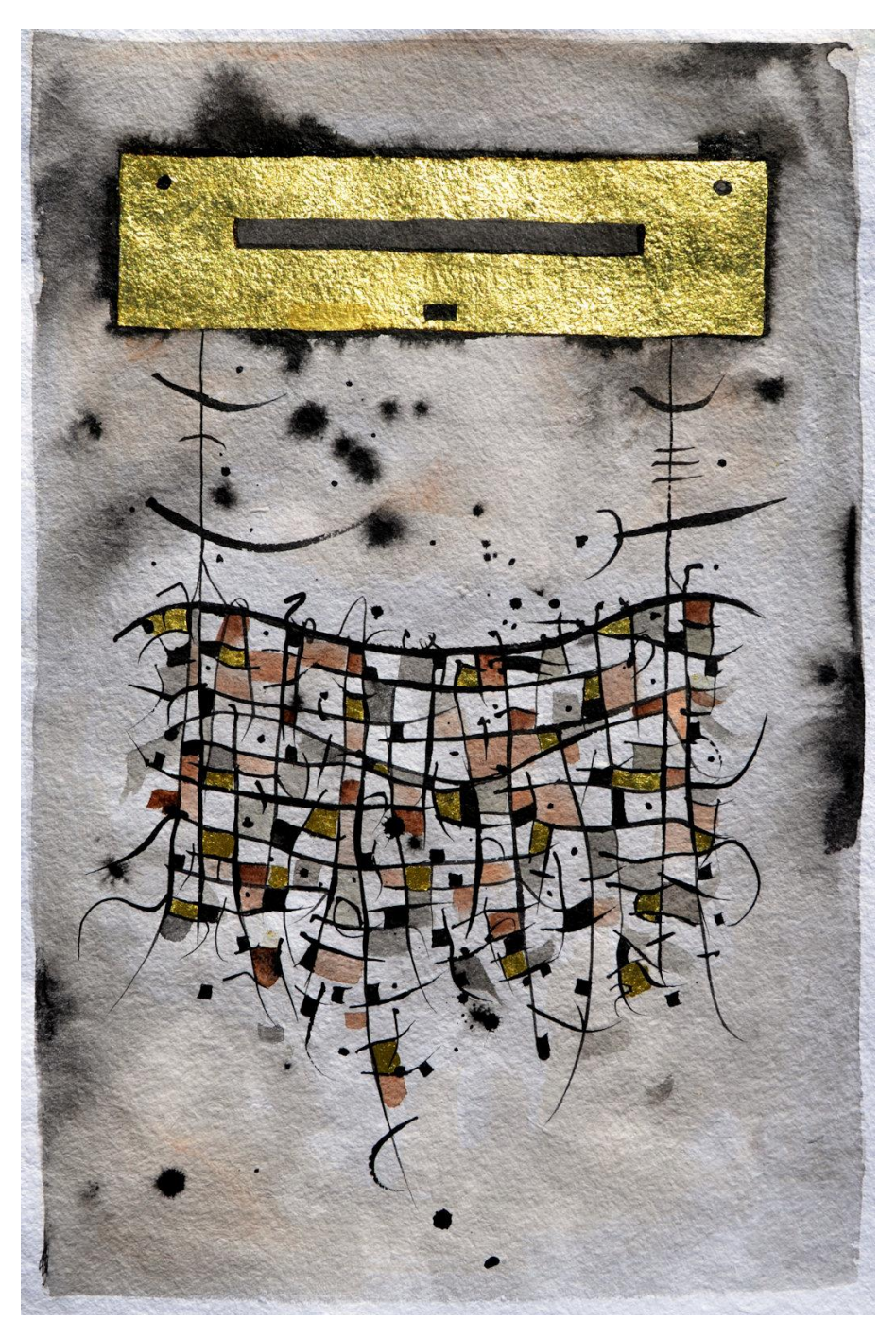
"Oro" Watercolor, ink and gilding on paper 22"x30"