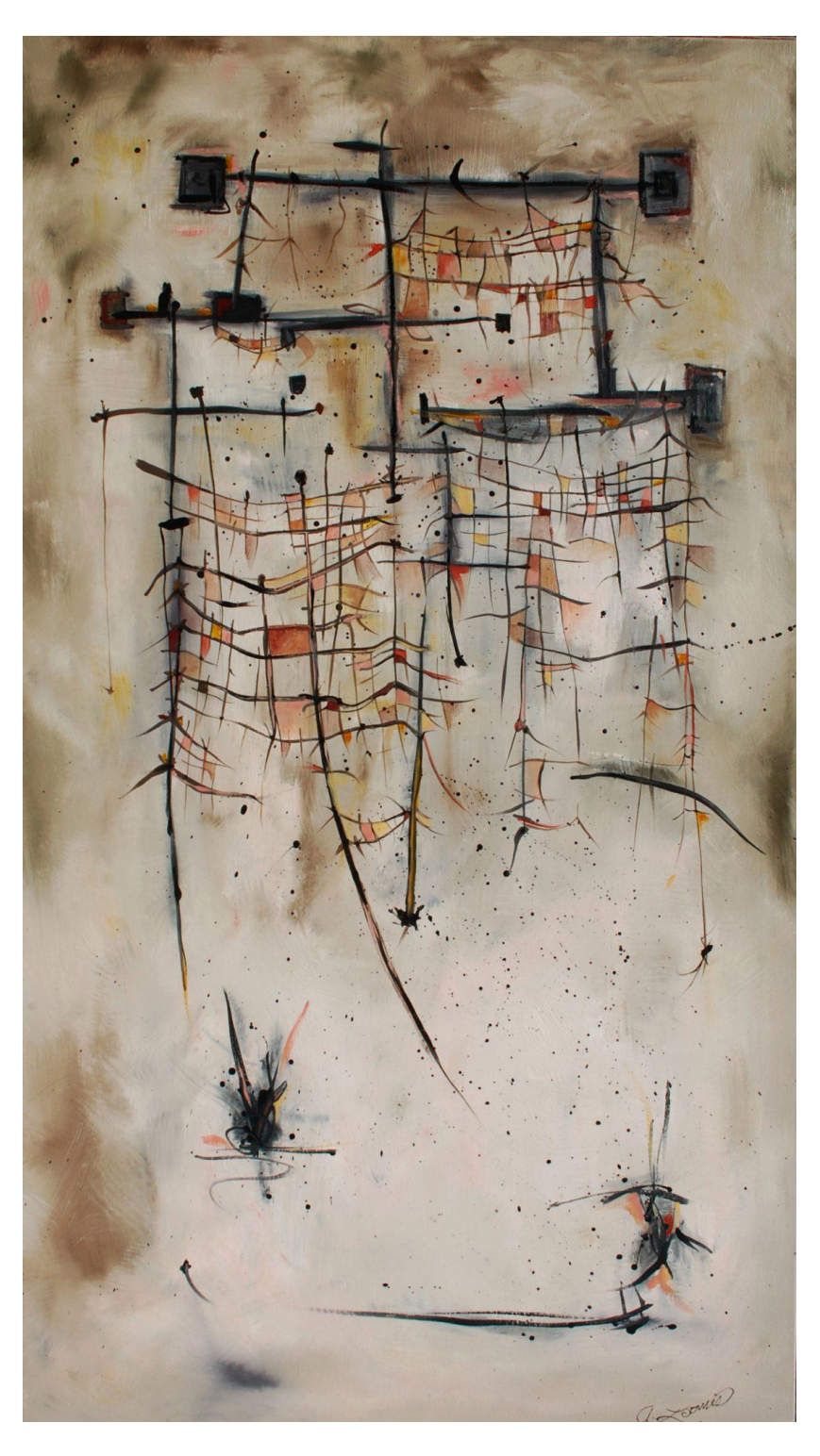
"Mauve" From the Interwoven Series Oil on canvas 30"x60"