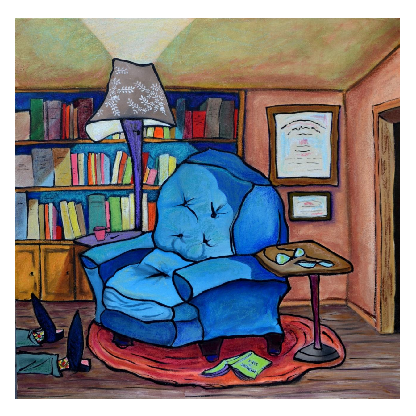
"Enlightenment" Oil on canvas 30"x30"